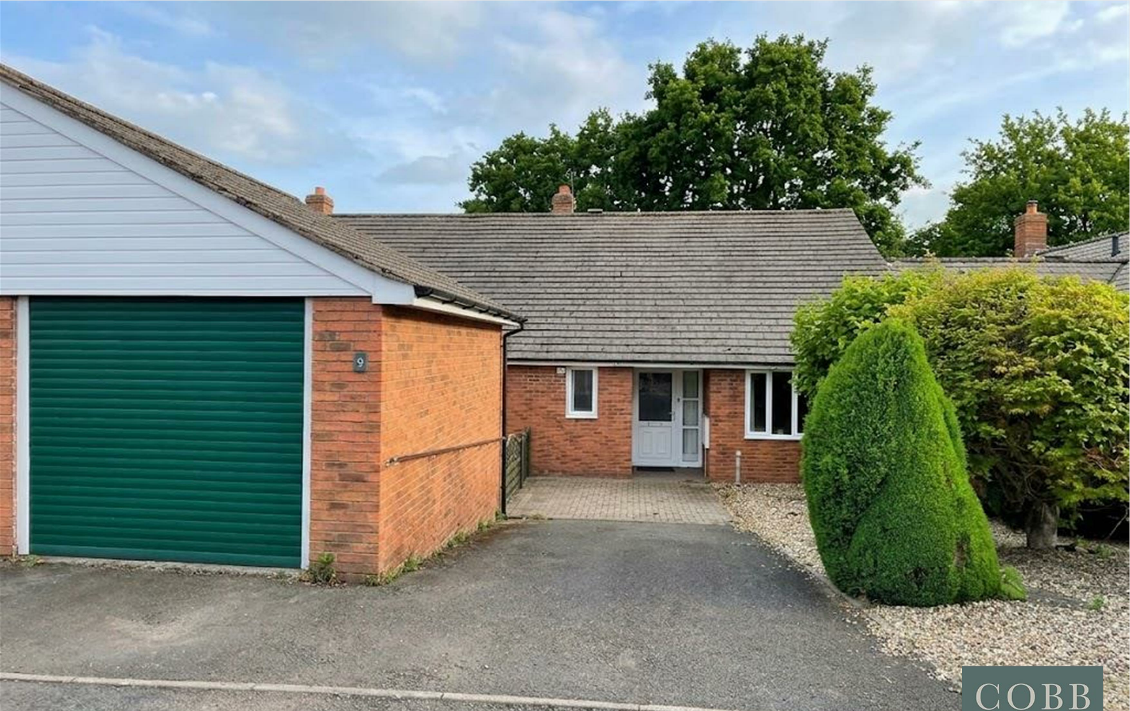
9, Lugwardine Court Orchard, Hereford, HR1 4HB Price £240,000